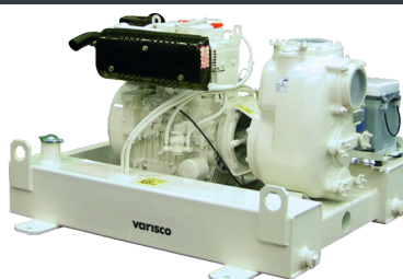
VAR 4-159 D BLOCK - E