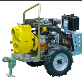
VAR 4-159 D TROLLEY - E